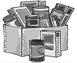
Feeding the Community

During the month of September the youth of the church will be sponsoring a food collection to benefit the Dunedin Cares Food Pantry. Pick up a grocery bag with a suggested list of food items, fill your bag and bring back by the end of the month. Thank you youth for your enthusiasm to help others!